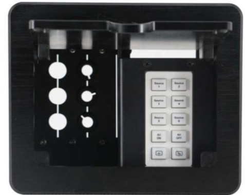
Table box (K10+ cables holder)