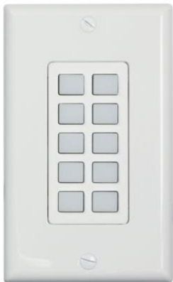
US one gang