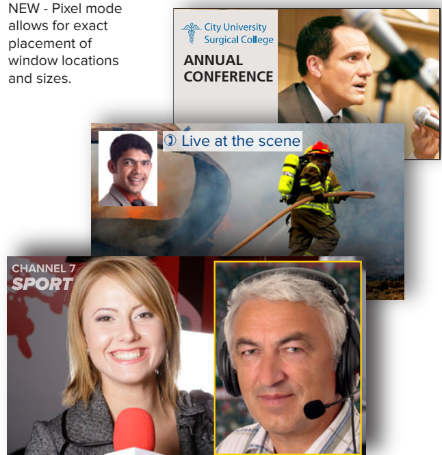
Picture-in-Picture capability - any size, any position

NEW - Pixel mode allows for exact placement of window locations and sizes.