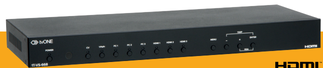
1T-VS-668 8-input Universal Scaler with Audio

SDI to HDMI scaler converts a variety of SDI transmission rates and video resolutions into an HDMI signal. It also provides audio flexibility by outputting the audio embedded in the SDI signal to external connectors (both analog and digital formats) for distribution separate from the HDMI data stream.