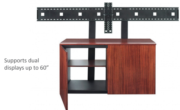
Supports dual displays up to 60"