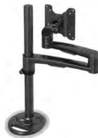
438-LC26B MONITOR ARM LC26, BLACK