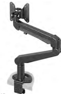
438-LC50B MONITOR ARM LC50, BLACK