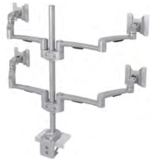
438-LC29 MONITOR ARM LC29 SYSTEM-4, SILVER