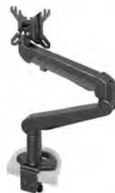
438-LC53B MONITOR ARM LC53, BLACK