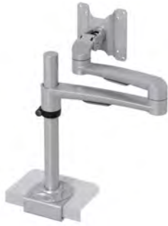
438-LC15 MONITOR ARM LC15, SILVER