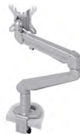
438-LC53 MONITOR ARM LC53, SILVER

Arm length 486 mm Load 8-14 kg Standard VESA 75/100 Table top 16-50 mm