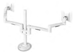
438-LC28W MONITOR ARM LC28 TWIN-ARM, WHITE