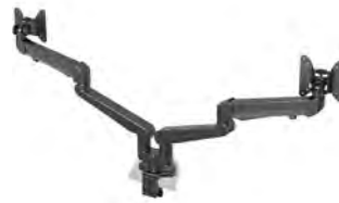
438-LC52B MONITOR ARM LC52 TWIN-ARM, BLACK