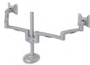
438-LC28 MONITOR ARM LC28 TWIN-ARM, SILVER