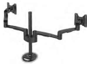
438-LC28B MONITOR ARM LC28 TWIN-ARM, BLACK