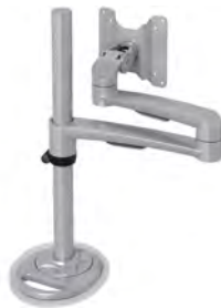
438-LC26 MONITOR ARM LC26, SILVER