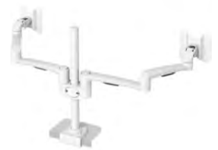
438-LC27W MONITOR ARM LC27 TWIN-ARM, WHITE