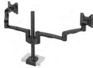
438-LC27B MONITOR ARM LC27 TWIN-ARM, BLACK