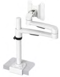
438-LC15W MONITOR ARM LC15, WHITE