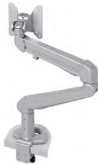
438-LC50 MONITOR ARM LC50, SILVER

Arm length 486 mm Load 3-8 kg Standard VESA 75/100 Table top 16-50 mm