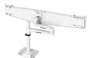
438-LC22W MONITOR ARM LC22 DUO-BAR, WHITE