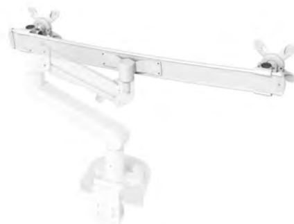
438-LC61W MONITOR ARM LC60 HEAVY DUO-BAR, WHITE