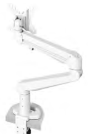
438-LC53W MONITOR ARM LC53, WHITE