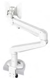
438-LC50W MONITOR ARM LC50, WHITE