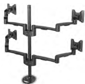
438-LC30B MONITOR ARM LC30 SYSTEM-4, BLACK