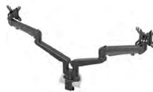
438-LC57B MONITOR ARM LC57 TWIN-ARM, BLACK