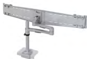
438-LC22 MONITOR ARM LC22 DUO-BAR, SILVER