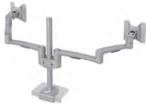
438-LC27 MONITOR ARM LC27 TWIN-ARM, SILVER