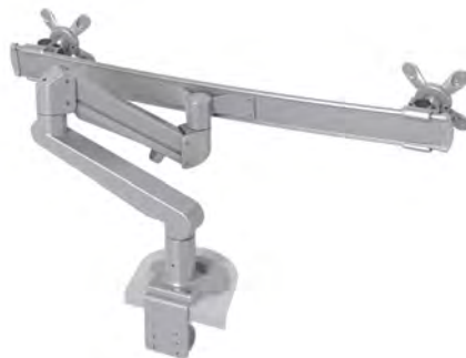
438-LC61 MONITOR ARM LC60 HEAVY DUO-BAR, SILVER

Arm length 570 mm Load 8-19 kg Standard VESA 75/100 Monitorbracket, max c/c 800 mm Table top 16-50 mm