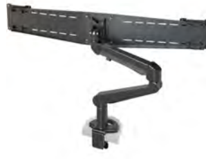
438-LC58B MONITOR ARM LC58 DUO-BAR, BLACK