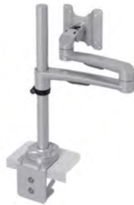
438-LC25 MONITOR ARM LC25, SILVER