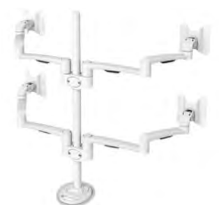
438-LC30W MONITOR ARM LC30 SYSTEM-4, WHITE