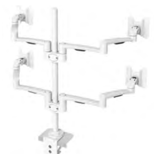
438-LC29W MONITOR ARM LC29 SYSTEM-4, WHITE