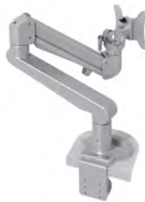
438-LC60 MONITOR ARM LC60 HEAVY, SILVER

Arm length 570 mm Load 8-19 kg Standard VESA 75/100 Table top 16-50 mm