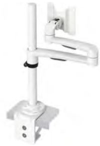
438-LC25W MONITOR ARM LC25, WHITE