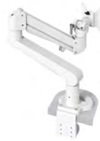
438-LC60W MONITOR ARM LC60 HEAVY, WHITE