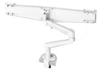
438-LC58W MONITOR ARM LC58 DUO-BAR, WHITE