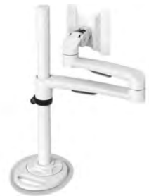
438-LC26W MONITOR ARM LC26, WHITE