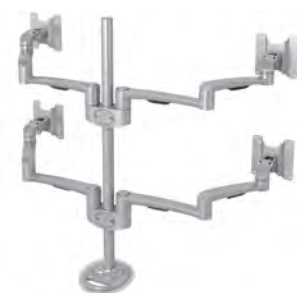
438-LC30 MONITOR ARM LC30 SYSTEM-4, SILVER