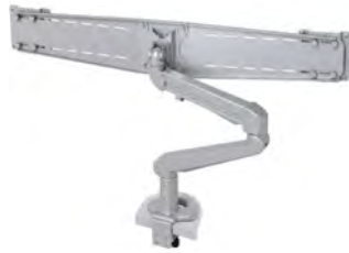
438-LC58 MONITOR ARM LC58 DUO-BAR, SILVER

Arm length 486 mm Load 2 x 6 kg Standard VESA 75/100 Monitorbracket, max c/c 750 mm Table top 16-50 mm