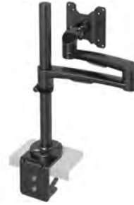
438-LC25B MONITOR ARM LC25, BLACK