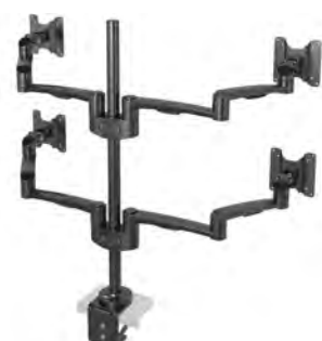
438-LC29B MONITOR ARM LC29 SYSTEM-4, BLACK