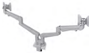
438-LC52 MONITOR ARM LC52 TWIN-ARM, SILVER

Arm length 486 mm Load 2 x 3-8 kg Monitorbracket, max c/c 878 mm Table top 16-50 mm