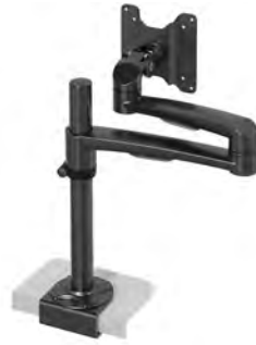
438-LC15B MONITOR ARM LC15, BLACK