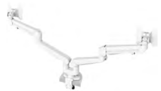
438-LC52W MONITOR ARM LC52 TWIN-ARM, WHITE