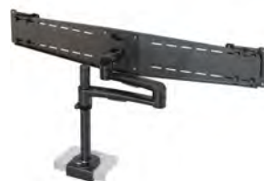
438-LC22B MONITOR ARM LC22 DUO-BAR, BLACK