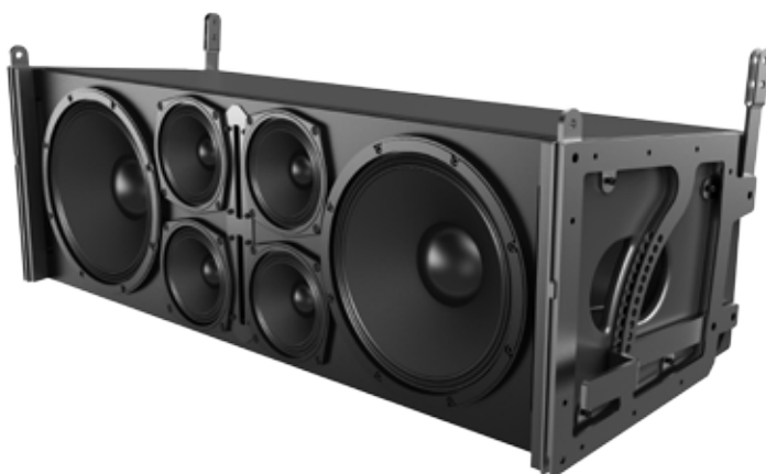
AL123A-B No Grille

©2014 Atlas Sound L.P. All rights reserved. Atlas Sound and Strategy Series are trademarks of Atlas Sound L.P. All other trademarks are the property of their respective owners. AT5004900 RevA 1/14