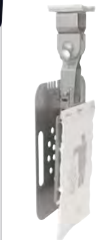
LiftSopi Waste Sac

Add on a Multi-cradle, so that you can hang on Sopi Waste Sacs or a Waste bin, as seen below.